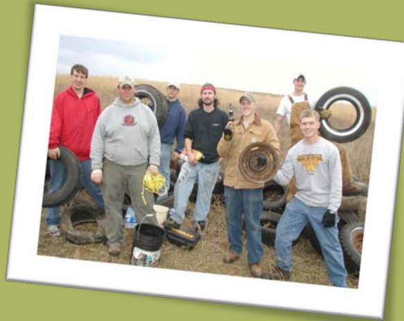
Constructing fish habitat with the IDNR at Lost Grove Lake

The American Fisheries Society was founded in 1870, and is the oldest and largest professional society representing fisheries scientists. The AFS promotes scientific research and enlightened management of aquatic resources for optimum use and enjoyment by the public. It also encourages comprehensive education of fisheries scientists and continuing on-the-job training.