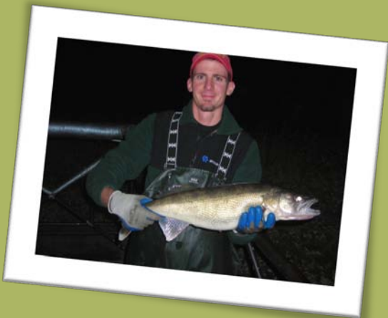
Night electrofishing for walleyes with the IDNR on Mississippi River