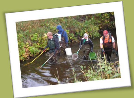
Stream electrofishing on ISU campus for our annual Squaw Creek assessment

The Iowa State University Student Subunit of the American Fisheries Society was founded in 2005. Since that time we have won the "Most Active Student Subunit Award" twice. We look forward to earning this great honor again this year.